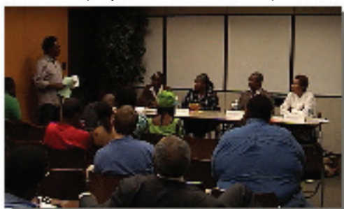
Law in America Panel