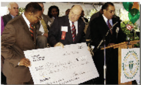
SunTrust Presentation at Groundbreaking