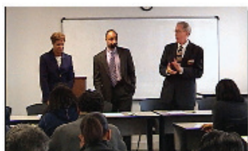
Hatchett Pre-Law Visit - Faculty Panel