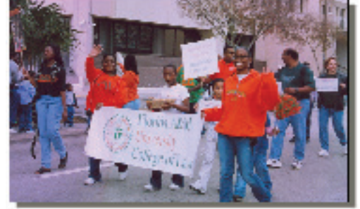
2004 Martin Luther King Parade