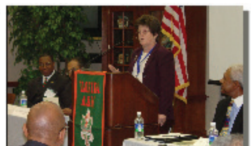
BLSA Spirit of Service Awards