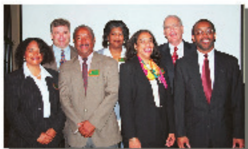
Members of the Founding Faculty