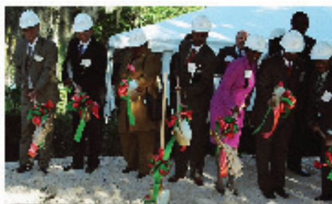
Groundbreaking for Permanent Campus