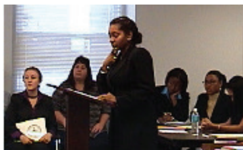
2003 Mock Trial