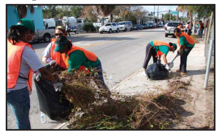
FAMU College of Law student organizations participated in the Day of Service in January with the Orlando Mayor's MLK Commission. Students painted waste recepticles, cleared debris, planted foliage and placed banners along Church Steet and Parammore Avenue.