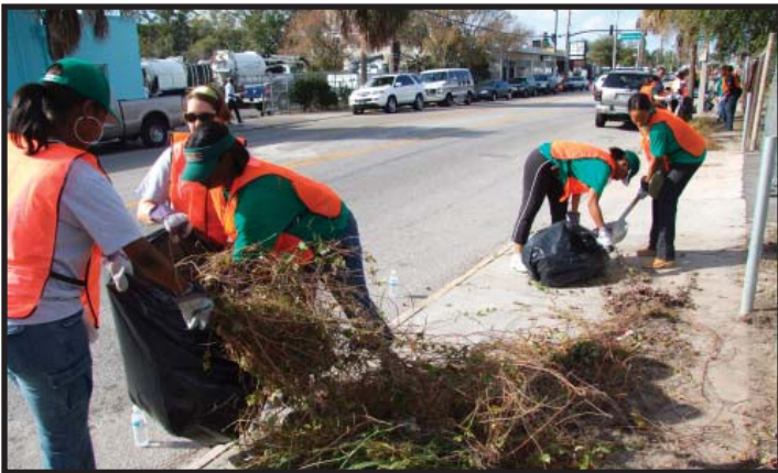
FAMU College of Law student organizations participated in the Day of Service in January with the Orlando Mayor's MLK Commission. Students painted waste receptacles, cleared debris, planted foliage and placed banners along Church Street and Paramore Avenue.