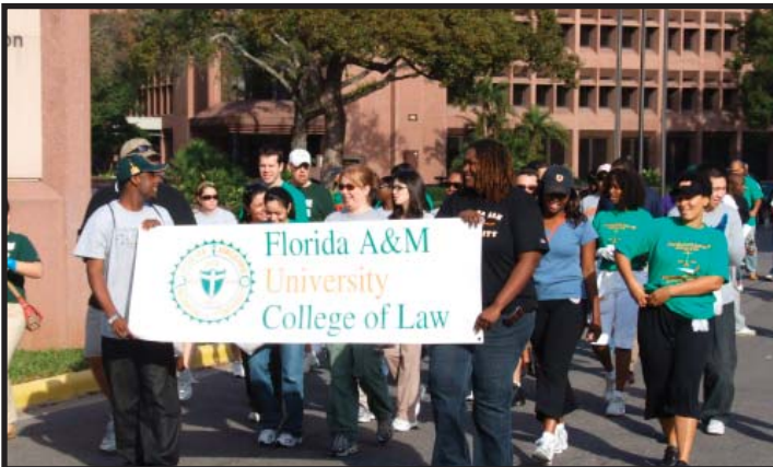
College of Law students march through the streets of the Parramore Neighborhood during the MLK Day of Service.