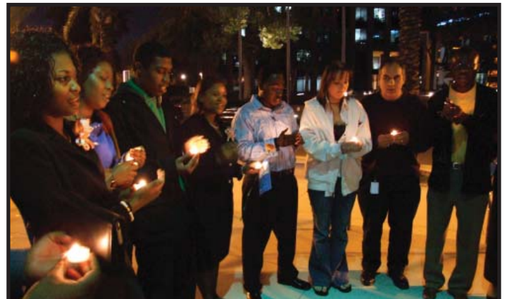
FAMU College of Law students gathered on the front steps to hold a candlelight vigil in honor of Dr. Martin Luther King, Jr. in January.